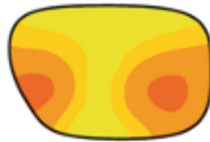
Distinctive Debut lens

Whereas wider fields of vision used to create aberrations, Distinctive Debut lenses control the cylinder for each prescription making the design softer, so wearers can enjoy their everyday life.