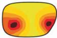
Standard progressive lens

The Distinctive Debut lenses are appreciated for their softness that eases the wearer's adaptation. This Essilor patented design, associated with the technologies allows optimized vision fields with limited aberrations.